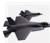
Aerospace / Defense