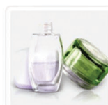
Health and Beauty